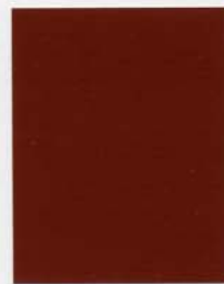
FRANCISCAN RED BC-1 CH-00103-60