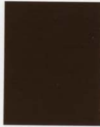
FOREST BROWN BC-1 CH-00093-60