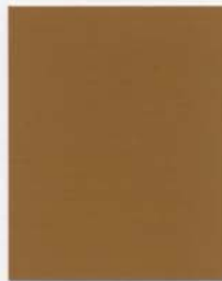
HARVEST AMBER BC-2 CH-00119-60