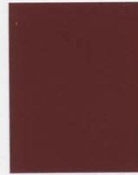
COCO PLUM BC-2 CH-00066-60