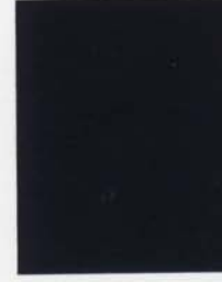
COBBLESTONE GRAY BC-1 CH-00061-60