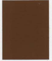
AUTUMN BROWN BC-1 CH-00013-60